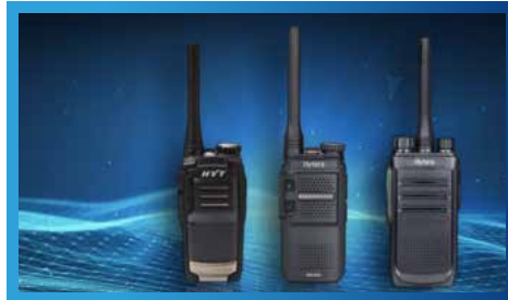
LICENSE FREE RADIO