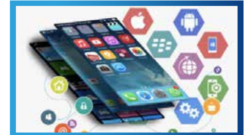
MOBILE APP DEVELOPMENT